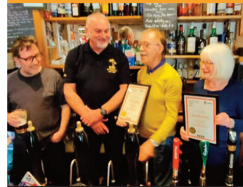
PUB OF THE YEAR 2026