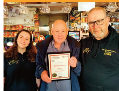
Cider Pub of the Year 2026