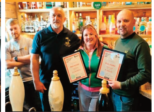
Town Pub of the Year 2026