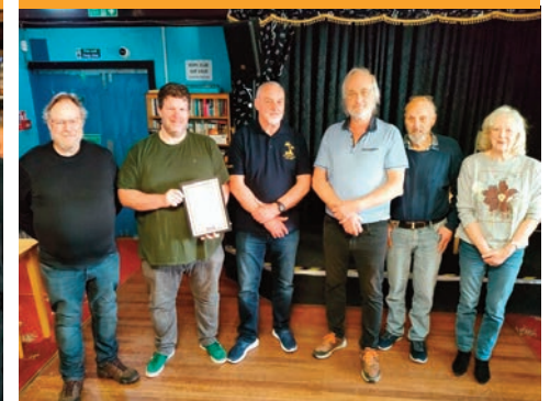
Club of the Year 2026