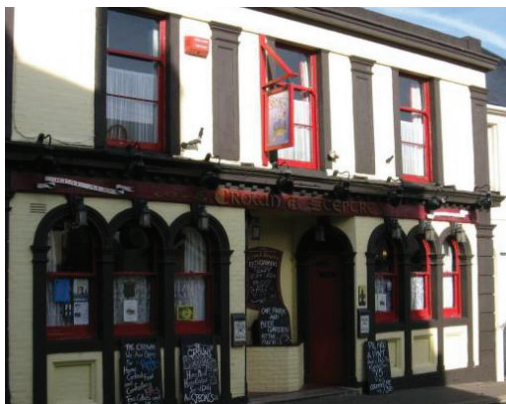
The Crown & Sceptre