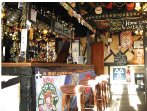
Breweriana and more!